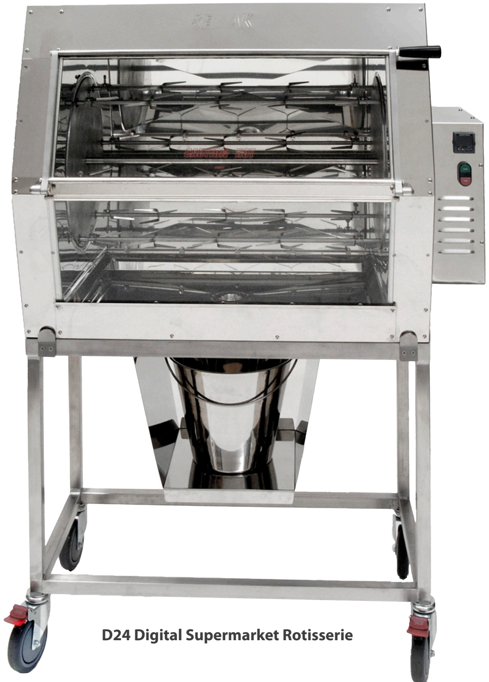
D24 Digital Supermarket Rotisserie